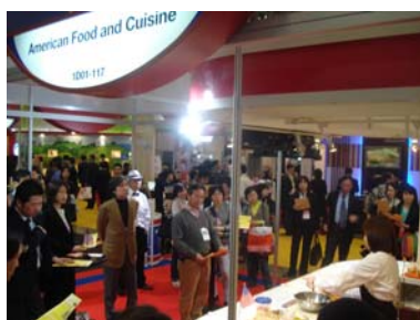
American Food and Cuisine Cooking Demo

An exciting attraction to the U.S. Pavilion was the "American Food and Cuisine" cooking demonstration booth which aimed to provide a platform for exhibiting organizations, and support for the Pavilion by entertaining visitors. The 2010 demonstration was based upon four separate themes, comfort food , traditional cuisine , fusion cuisine , and simple recipes .