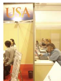
BSC reception and laptops