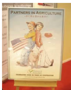
Partners in Agriculture at BSC

This year, in addition to the myfood.jp, and the ATO business website, the internet cafe highlighted the Partners in Agriculture program.