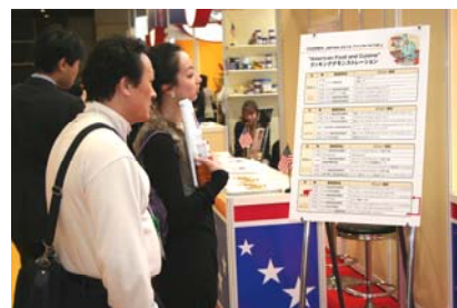
Cooking demo menu with four days and four themes

Several organizations, both major associations and individual exporters, were featured in the cooking demonstration, including the U.S. Grains Council, the American Peanut Council, California Olive Ranch and American Indian Foods. Demonstrations were cross functional in that visitors could taste the various American recipes while watching cooking demonstrations and follow up for more information at the related booths. Furthermore, the demonstration